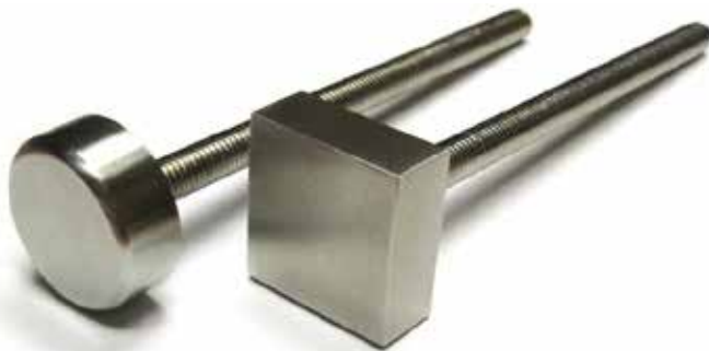
90230KR ø30mm, 12mm thick