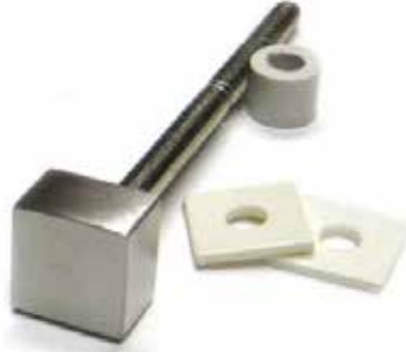
90215KK 15mm square, 10mm thick