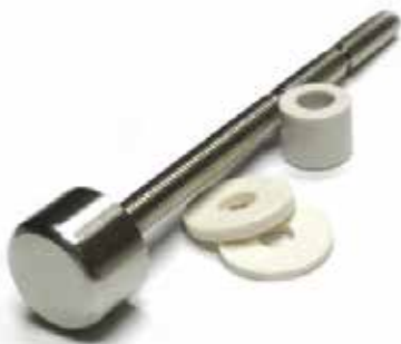
90215KR ø15mm, 10mm thick